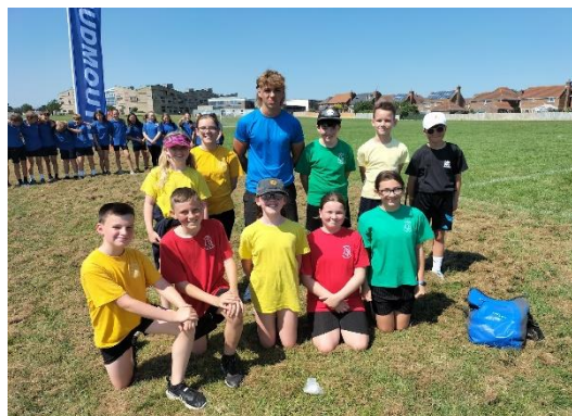
Year 6 show their skills at Budmouth Tag Rugby Festival