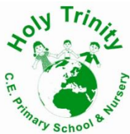
Holy Trinity C.E. Primary School & Nursery